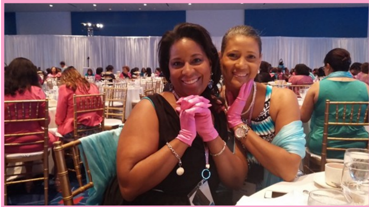
The room filled with cheer as we celebrated the chapters that scored a Superior rating on their handbooks. The room was filled with pick and blue, "oh what a beautiful sight". PWC Chapter was recognized for our program book.

Instead of heading back to the room to relax and chill after such a fun filled evening, we trudged into the ballroom along with 300+ mothers for the budget committee review meeting...immediately followed by the Eastern region caucus. And finally we are back in room 1621. It's 2:00am and we can barely keep our eyes open.